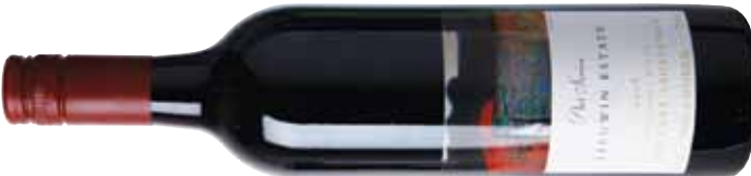
Leeuwin Estate, Art Series, Margaret River 2008 18.5 (95) RJ 18.5 PM 18.5 AR 18.5

£33–£37 Domaine Direct, Secret Cellar, WoodWinters No Cabernet in Margaret River has been more dramatically transformed over the past decade than this. Once a style of clunky oak, assertive tannins and haphazard ripeness, a complete makeover in the vineyards has produced more even ripeness and permitted earlier harvesting to capture the hallmarks of the variety, elevating this wine to its rightful position alongside the estate’s famous Art Series Chardonnay. Leeuwin’s Art Series philosophy is to represent its finest, most ageworthy wines, and its Cabernet now confidently meets this brief.